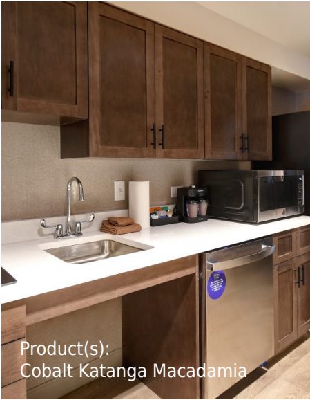
Product(s): Cobalt Katanga Macadamia