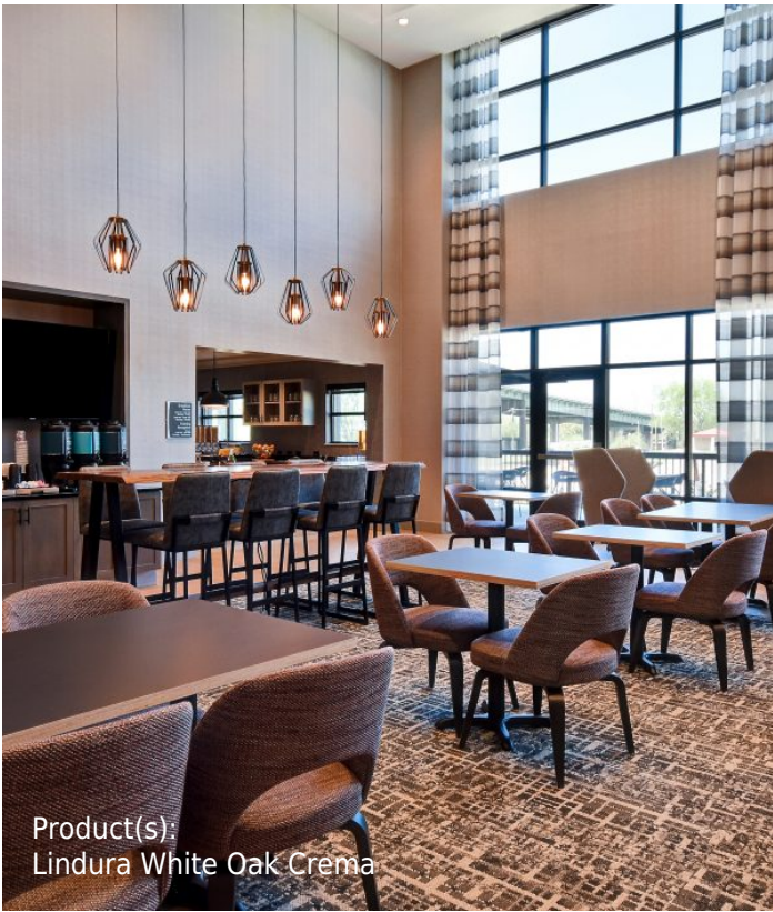
Product(s): Lindura White Oak Crema