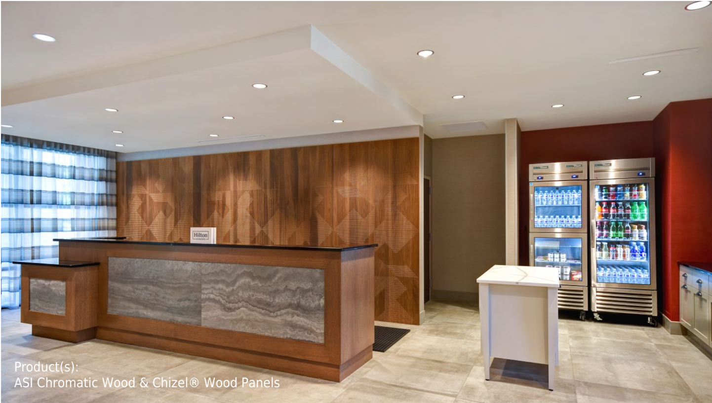
Product(s): ASI Chromatic Wood & Chizel® Wood Panels