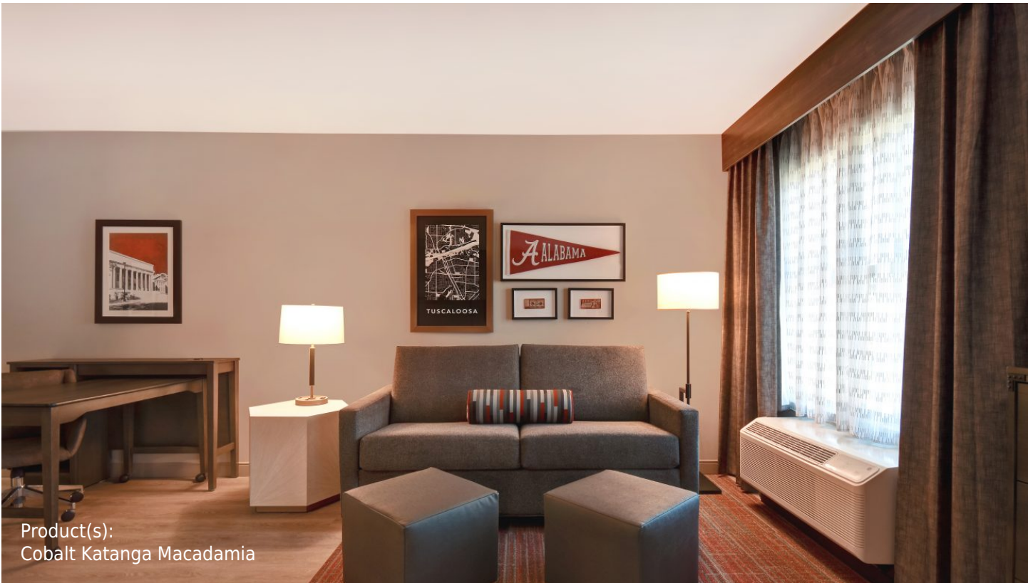
Product(s): Cobalt Katanga Macadamia