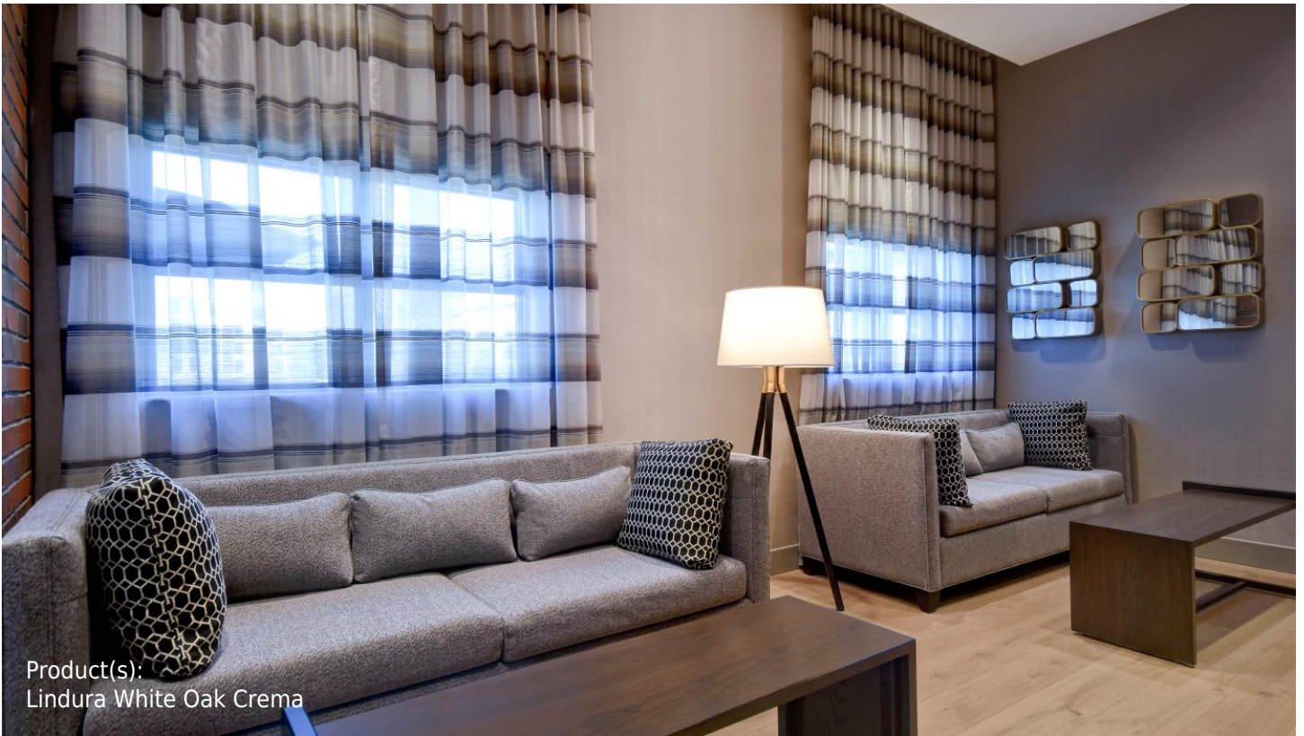
Product(s): Lindura White Oak Crema