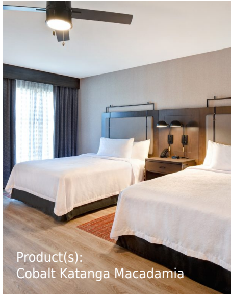
Product(s): Cobalt Katanga Macadamia