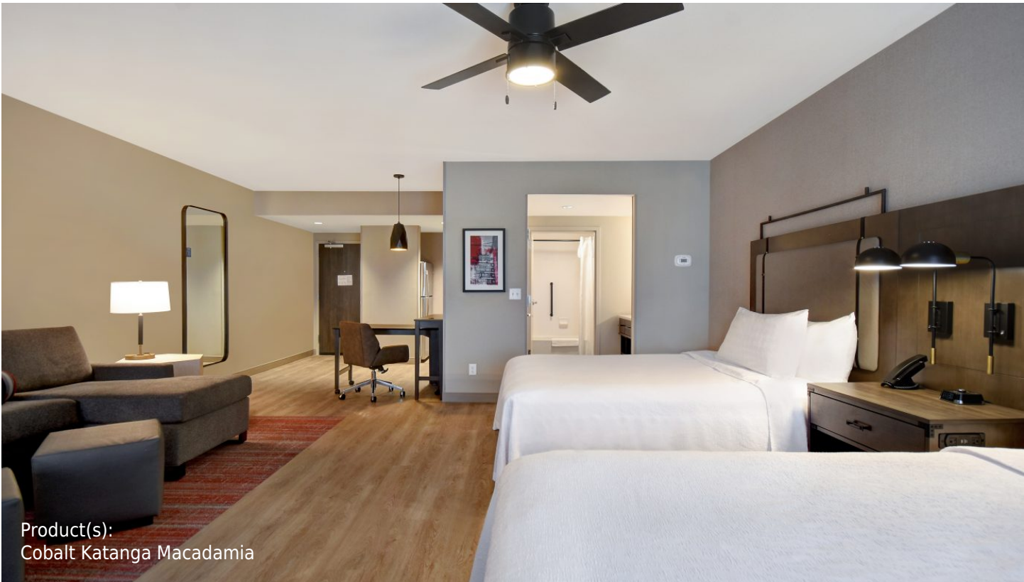
Product(s): Cobalt Katanga Macadamia