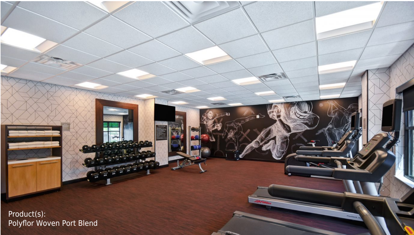
Product(s): Polyflor Woven Port Blend