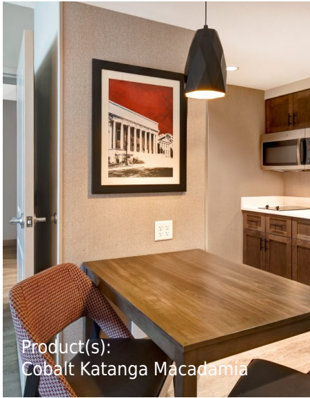
Product(s): Cobalt Katanga Macadamia